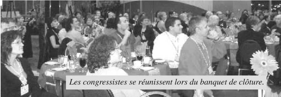
Les congressistes se réunissent lors du banquet de clôture.