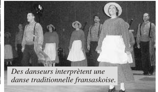
Des danseurs interprètent une danse traditionnelle fransaskoise.