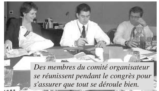
Des membres du comité organisateur se réunissent pendant le congrès pour s'assurer que tout se déroule bien.