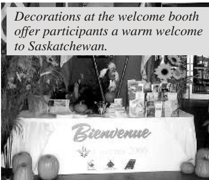
Decorations at the welcome booth offer participants a warm welcome to Saskatchewan.