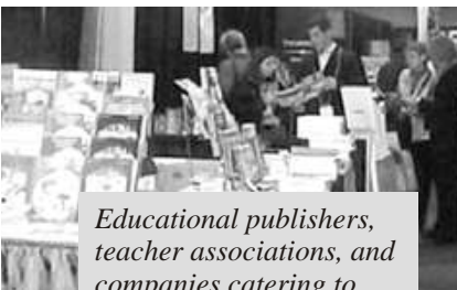
Educational publishers, teacher associations, and companies catering to French language teachers answer questions and display new resources.