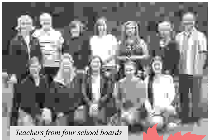
Teachers from four school boards in Ontario receive training on the Intensive French approach to FSL teaching, June 4-6, 2007 in Toronto.