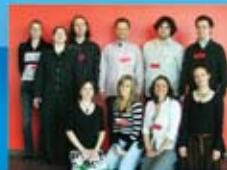
SPEAQ/CASLT ESL teachers convention, Université du Québec en Abitibi- Témiscamingue, March 2008.