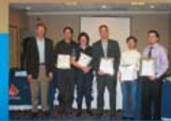
Media panel at CASLT Association Day, December 2007.