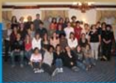
SEVEC/CASLT National Teacher/Youth Linguistic Duality Forum, Gatineau, November 2007.