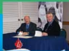
Partnership signing with the Official Languages and Bilingualism Institute, University of Ottawa, November 2007.