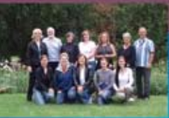
Intensive French Teacher Training in Toronto, June 2007.

L'Association canadienne des professeurs de langues secondes