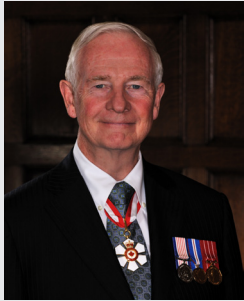
His Excellency the Right Honourable David Johnston, C.C., C.M.M., C.O.M., C.D., Governor General and Commander-in-Chief of Canada.