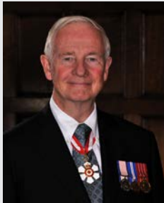
His Excellency the Right Honourable David Johnston, C.C., C.M.M., C.O.M., C.D., Governor General and Commander-in-Chief of Canada.